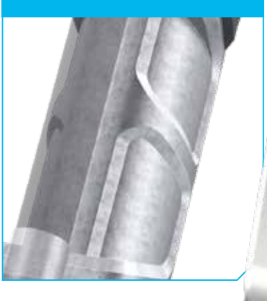
is also less prone to damage when dropped