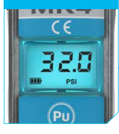
Biomorphic body shape gives a lighter weight, ergonomic feel. The design