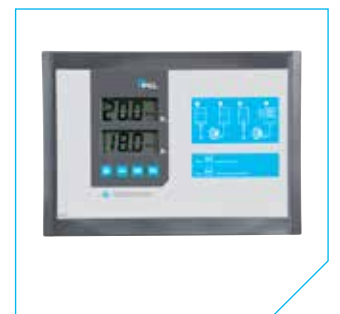
Fixed wall mounted/OEM inflation boxes