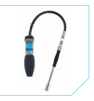
Pressure checking gauges