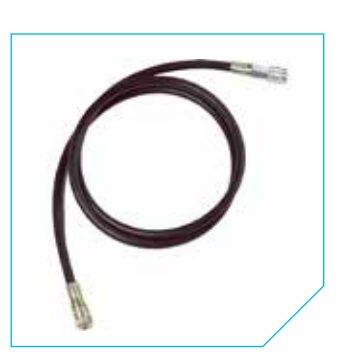
Replacement hoses, spares, service and recalibration