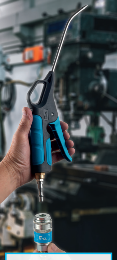
Rp 1/4 Female Brass Inlet Max Pressure: 10 bar